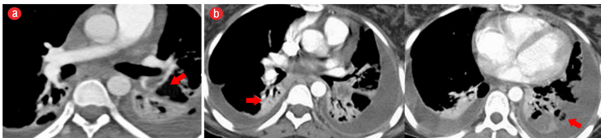
Figure 2: (a) Pulmonary angiography with computed tomography of the chest showing a filling defect denoting embolism in the lower lobe segmental branch of the left pulmonary artery (red arrow). (b) The lung fields show multiple atelectatic changes (red arrows) and bilateral pleural effusion.

Lemierre's syndrome was first described in the 1930s by Andre Lemierre, who studied a series of throat infection cases with cervical extension and septicemia. It was known as 'the forgotten disease,' but in the recent years, the number of published cases has increased. The reason for the increase in the number of cases of Lemierre's syndrome is believed to be the more prudent and judicious antibiotic-prescribing habits in the setting of upper respiratory tract infections, especially pharyngitis, which used to be treated swiftly with penicillin. 1,2,10 Some